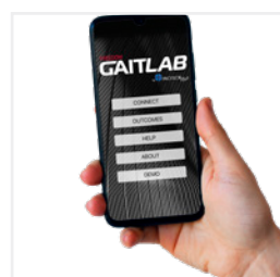
Setup & configure using dedicated apps