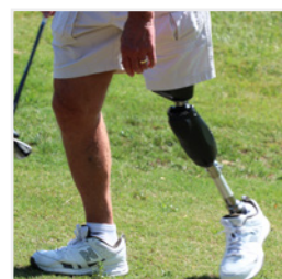
Intuitive stance lock