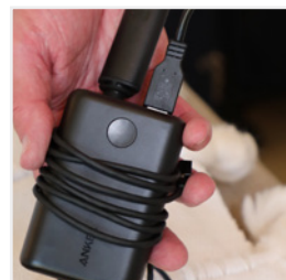
Battery Booster Kit